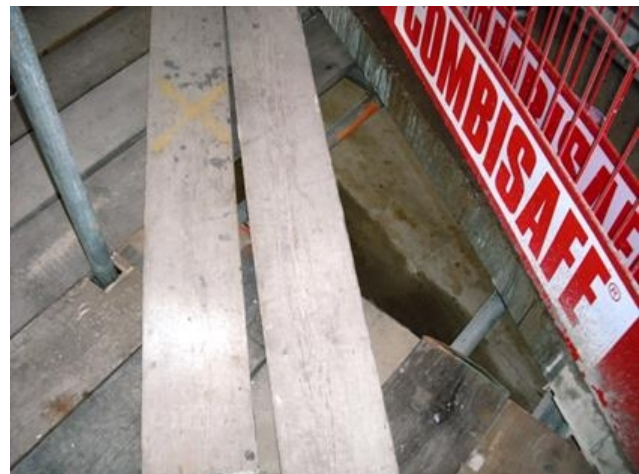
edge protection missing 2