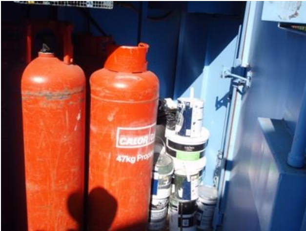
Gas and Flammable paint storage