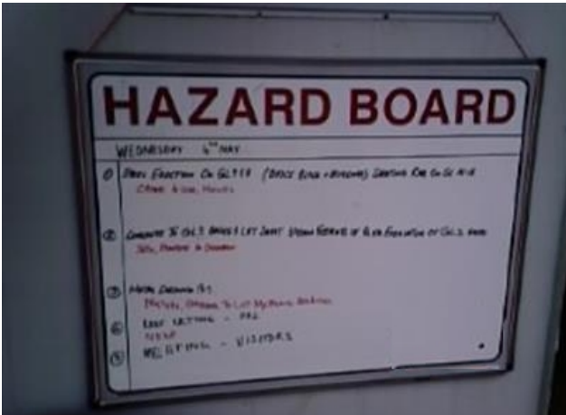
Hazard white board