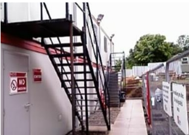
Site Cabin arrangement