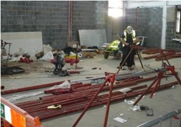
subcontract supervision inadequate