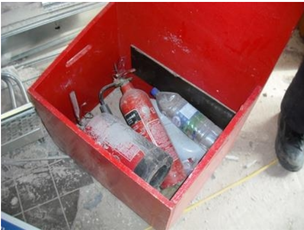
Fire equipment storage