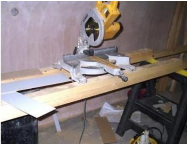
chop saw no extraction