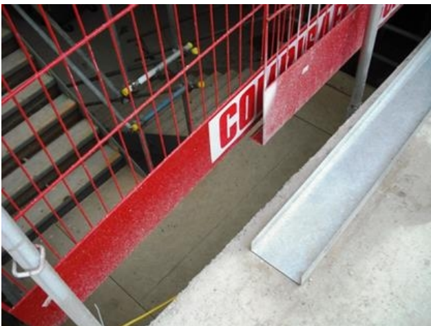
edge protection missing