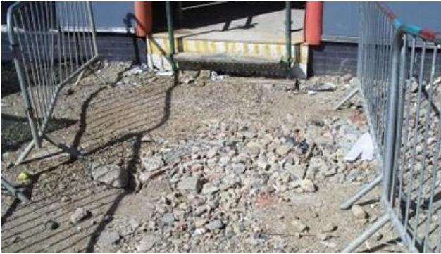
Rough filling for MEWP access